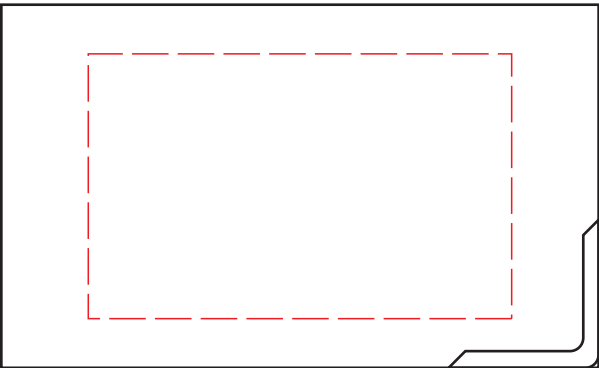
Side 1 (Front)